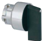
8 LM2T S2...